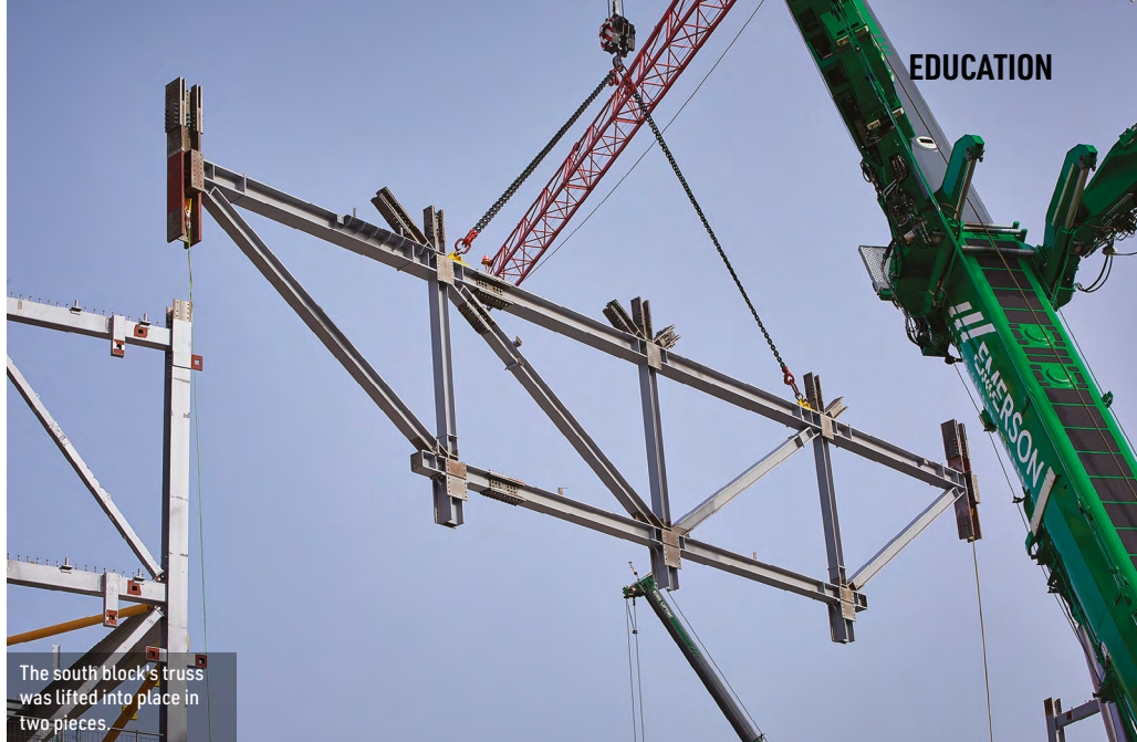
The south block's truss was lifted into place in two pieces.

B75 is scheduled for completion in Autumn 2027 ready for a new cohort of medical students to begin their studies in a state of the art learning environment. ■