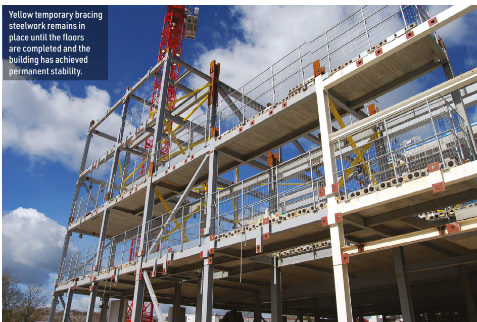
Yellow temporary bracing steelwork remains in place until the floors are completed and the building has achieved permanent stability.