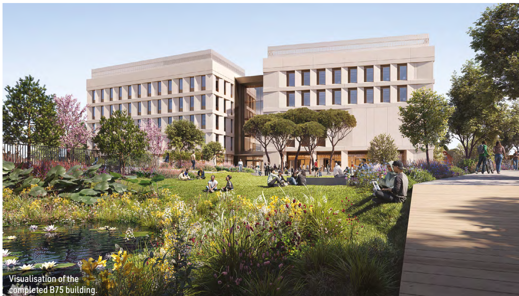
Visualisation of the completed B75 building.

"For the two blocks that need to have column-free floorplates, steelwork was the most-efficient method of construction, while the use of precast planks provided a quick installation programme - alongside the steel - and gave us the required acoustics."