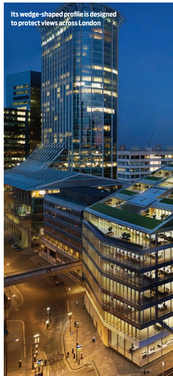
Its wedge-shaped profile is designed to protect views across London

Designing the frame in steelwork instead of