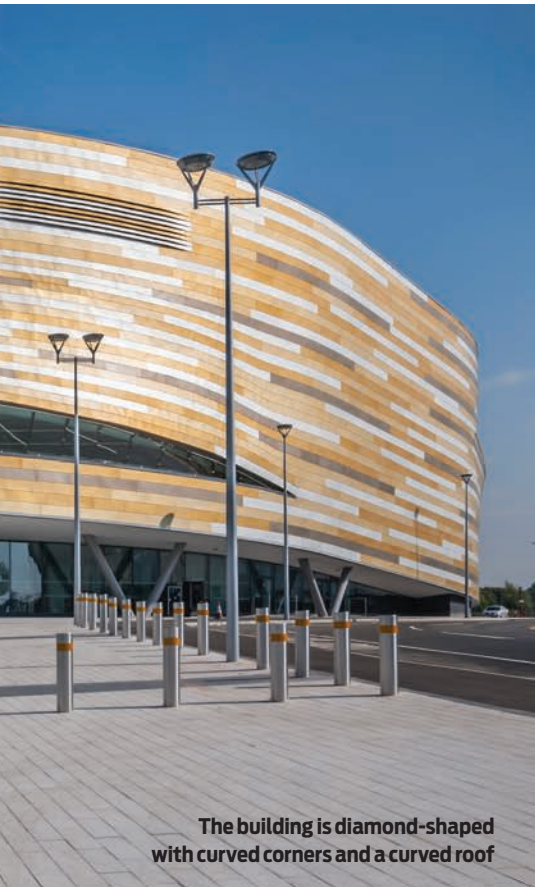
The building is diamond-shaped with curved corners and a curved roof

COMMENDATION: GREENWICH REACH SWING BRIDGE, LONDON