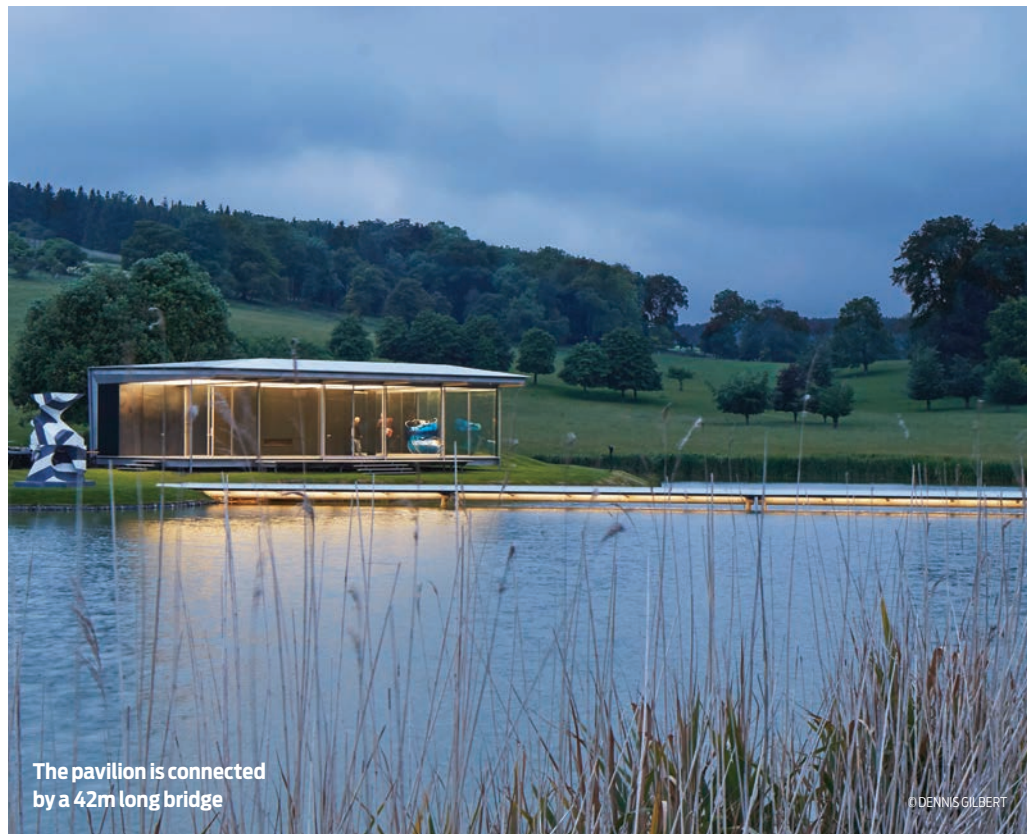
The pavilion is connected by a 42m long bridge

The pavilion utilises an illuminated, acoustically transparent ceiling, insulation-