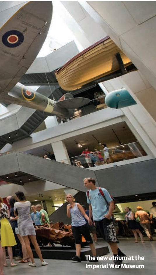
The new atrium at the Imperial War Museum

suitable material for the job to match the existing exposed steel frame. The majority of the steelwork has been finished with intumescent paint, with areas that are visible in the final condition being matched to the finish of the existing steelwork.