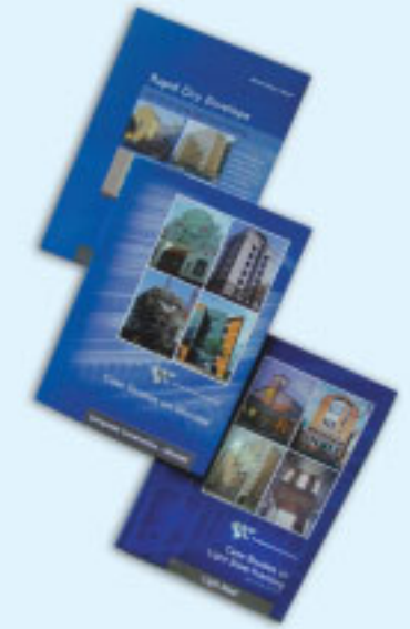
CORUS PUBLICATION Slimdek<sup>®</sup> Manual

Acoustic Performance of Slimdek® (P321) Acoustic Performance of Composite Floors (P322)