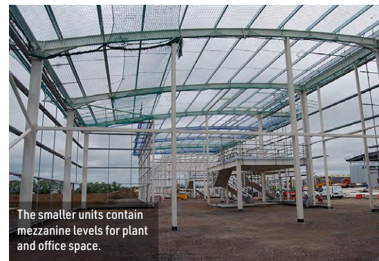
The smaller units contain mezzanine levels for plant and office space.

steelwork, the structure has two 26.5m-wide spans, formed with spliced roof rafters, which were brought to site in halves, assembled on the ground and then lifted into place as complete sections.