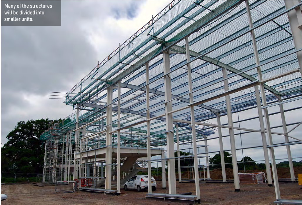
Many of the structures will be divided into smaller units.