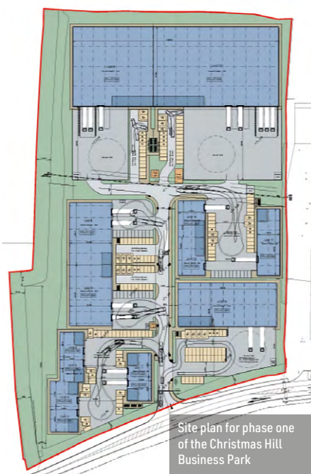
Site plan for phase one of the Christmas Hill Business Park