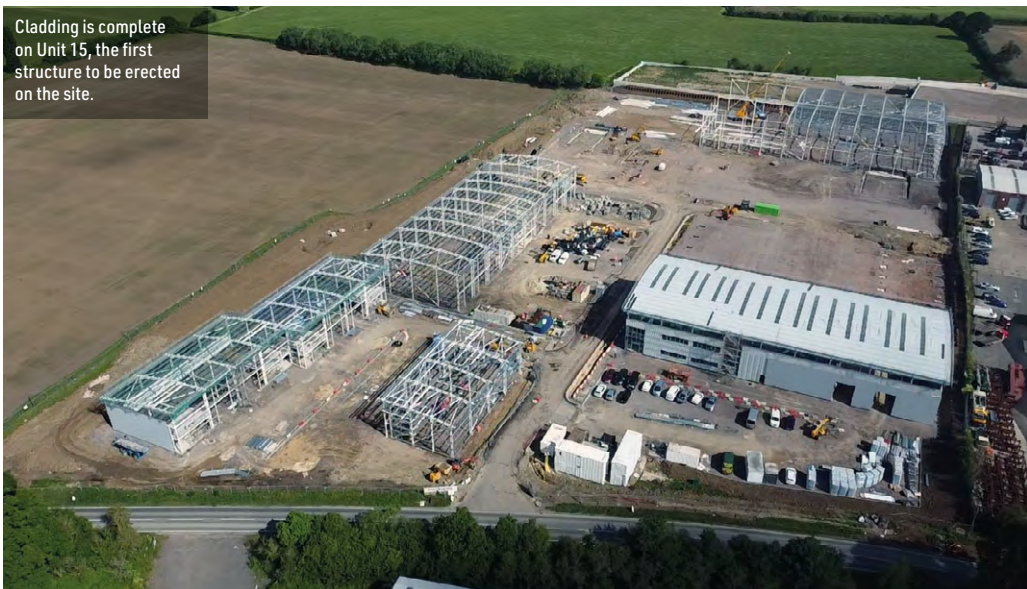
Cladding is complete on Unit 15, the first structure to be erected on the site.

"Cost and availability as well as the ease with which the material can form the required internal spans, make steel the right choice for this development."