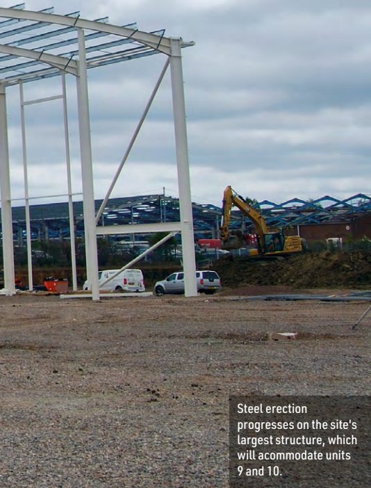
Steel erection progresses on the site's largest structure, which will accommodate units 9 and 10.