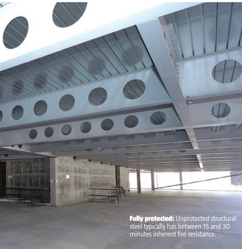
Fully protected: Unprotected structural steel typically has between 15 and 30 minutes inherent fire resistance.