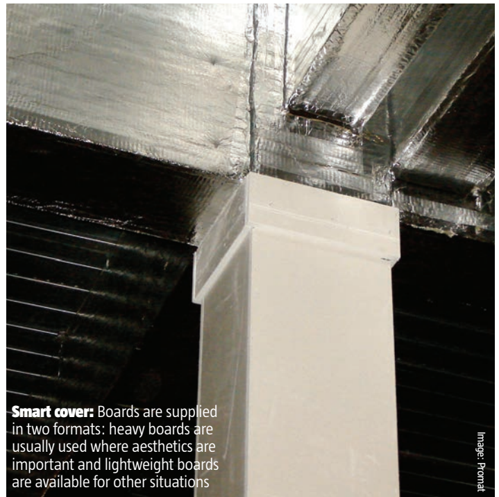
Smart cover: Boards are supplied in two formats: heavy boards are usually used where aesthetics are important and lightweight boards are available for other situations