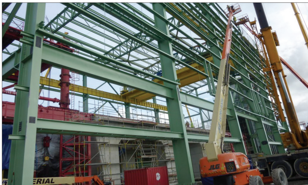
Powerful presence: The 25m high turbine building is the largest building on the site