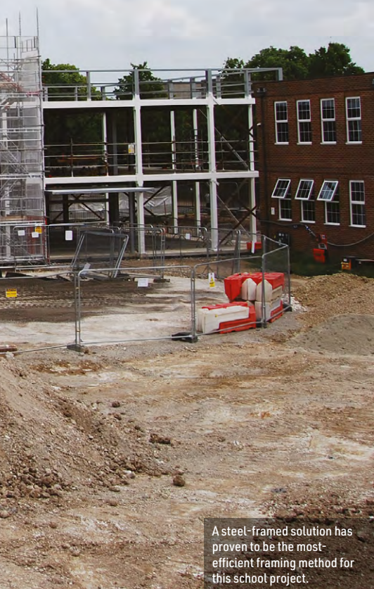
A steel-framed solution has proven to be the most efficient framing method for this school project.

Borden Grammar School, Sittingbourne Main client: Kent County Council Architect: Hazle McCormack Young (HMY) Main contractor: Kier Construction Structural engineer: CampbellReith Consulting Engineers Steelwork contractor: H Young Structures Steel tonnage: 160t