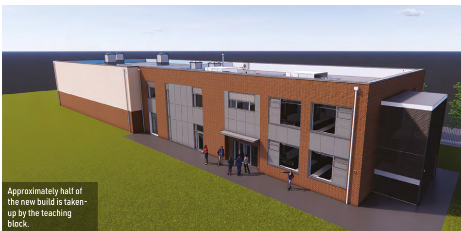
Approximately half of the new build is taken up by the teaching block.

Main contractor for the project Kier Construction, working on behalf of Kent County Council, has considerable experience in the education sector , as well as in Kent (see NSC July 2021).