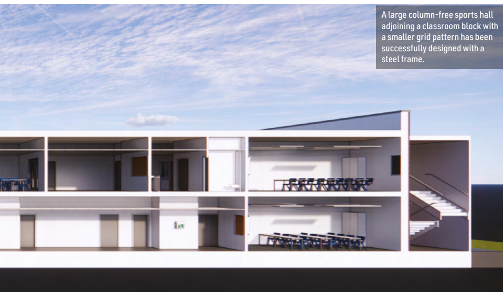
A large column-free sports hall adjoining a classroom block with a smaller grid pattern has been successfully designed with a steel frame.