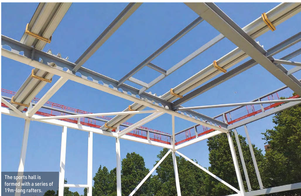
The sports hall is formed with a series of 19m-long rafters.