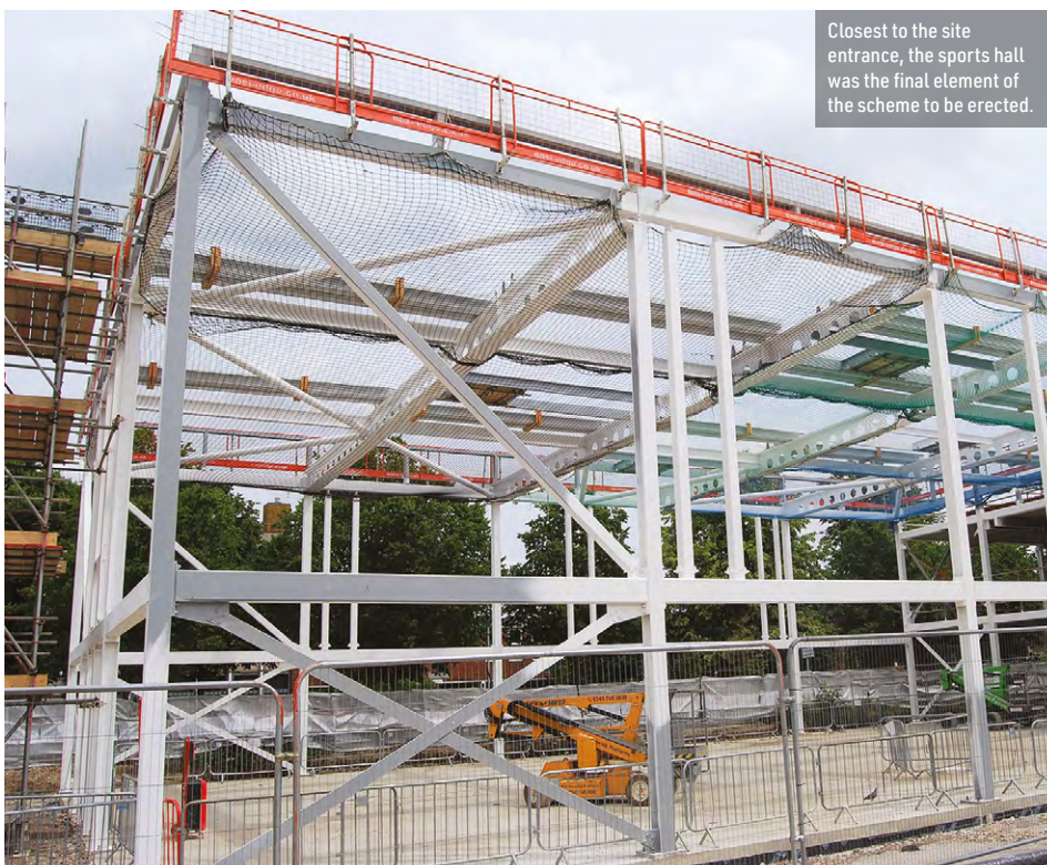
Closest to the site entrance, the sports hall was the final element of the scheme to be erected.

Using the installed slab as a flat and safe surface for its MEWPs and a crane mat installed along the entire southern elevation, the steel frame,