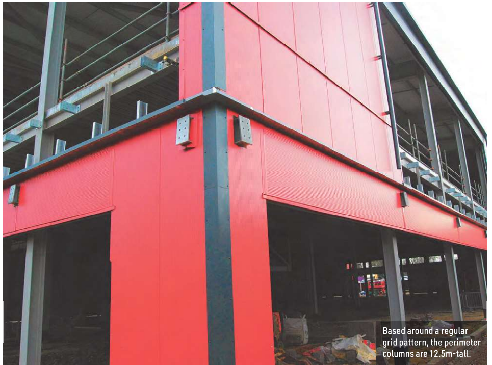
Based around a regular grid pattern, the perimeter columns are 12.5m-tall.

Working on behalf of Amiri Construction, SMD