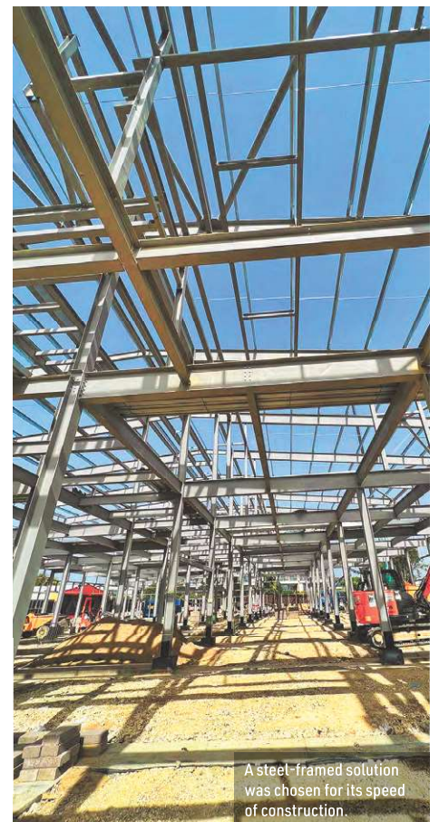
A steel-framed solution was chosen for its speed of construction.

“Working with industry leaders in entertainment and retail, we have created the right platform to deliver state of the art activities that can be enjoyed by our family guests and those on adult only Big Weekender breaks both day and night and whatever the weather. As the Home of Entertainment, we’re continually looking to create unforgettable experiences and with PLAYXPERIENCE opening next year, we’re offering the best range of activities under one roof.” ■