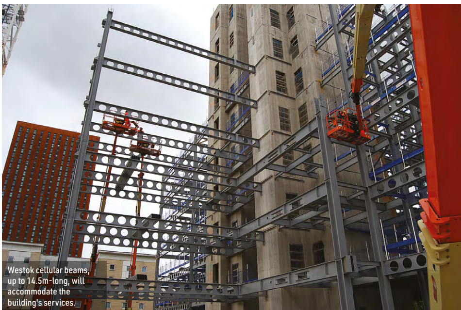
Westok cellular beams, up to 14.5m-long, will accommodate the building's services.