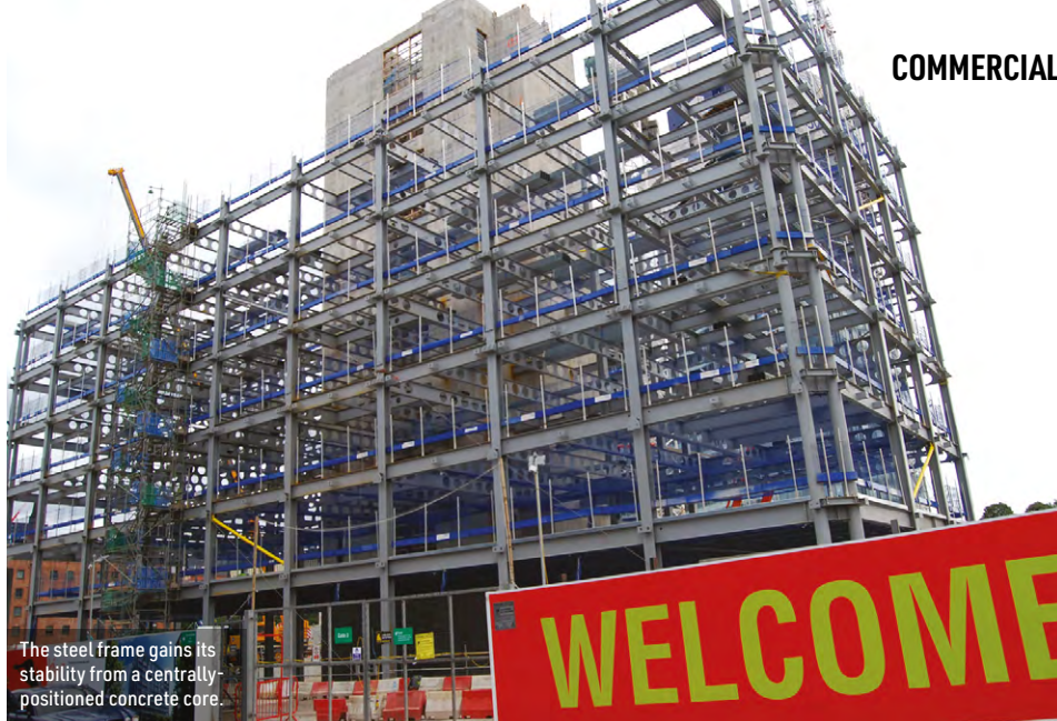
The steel frame gains its stability from a centrally-positioned concrete core.

"This arrangement provides the architectural requirement for long column-free spans of up to