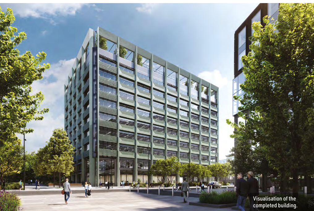
Visualisation of the completed building.