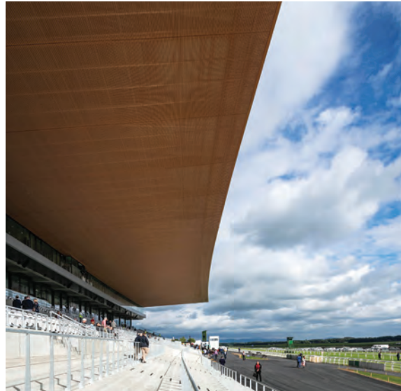
Above: The complex roof design involved careful coordination with the facade

Integrating the structural solution with the building envelope was also key to the success of realising the team’s