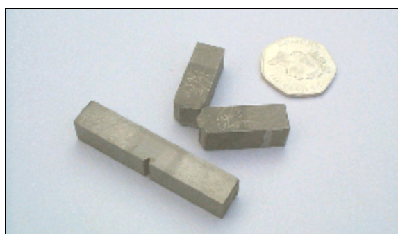
Charpy impact test pieces