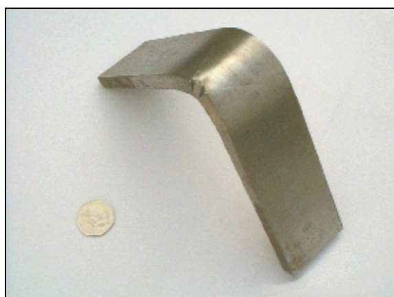
Bend test (note opening of root defect)