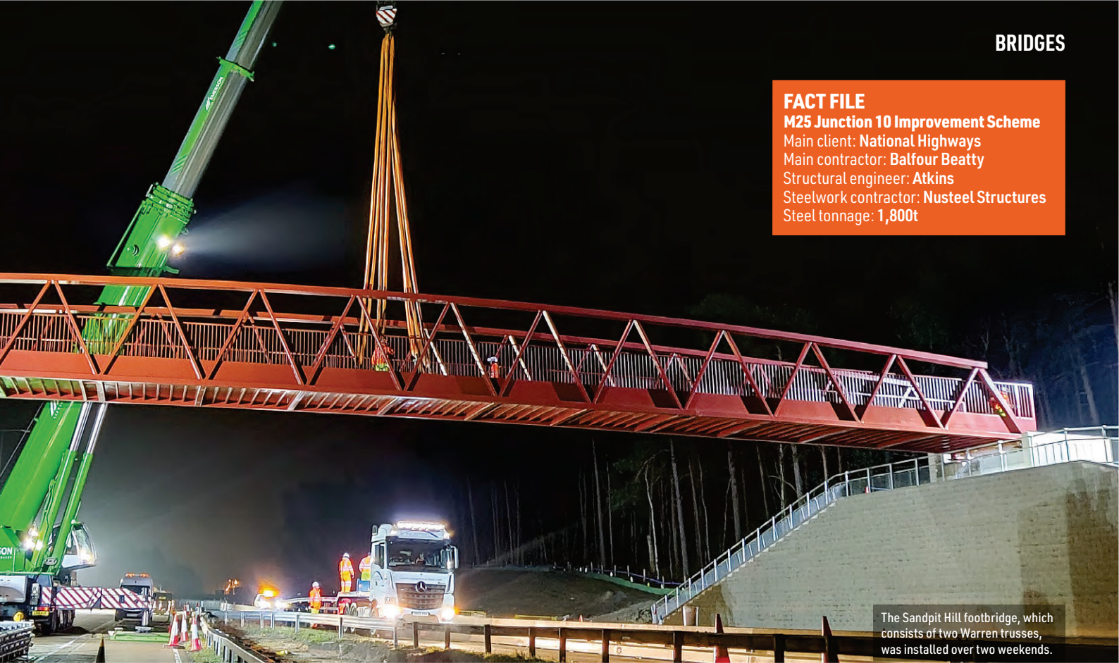
The Sandpit Hill footbridge, which consists of two Warren trusses, was installed over two weekends.

FACT FILE M25 Junction 10 Improvement Scheme Main client: National Highways Main contractor: Balfour Beatty Structural engineer: Atkins Steelwork contractor: Nusteel Structures Steel tonnage: 1,800t