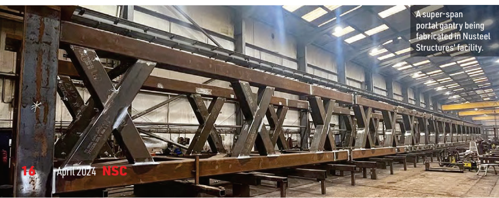
A super-span portal gantry being fabricated in Nusteel Structures' facility.

"Assembling the bridge offsite and then using SPMTs to transport and install the complete structure is the quickest method. We will only need to close this section of the M25 for one day." ■